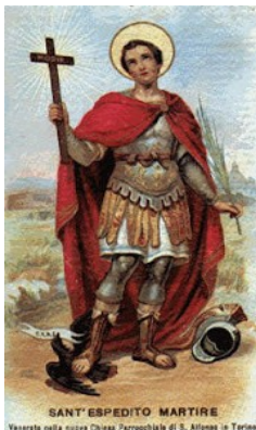
HooDoo Mamba -

“Open your bottle of Oil and anoint yourself. Relax and allow the spirit of the Lord to search your body. “