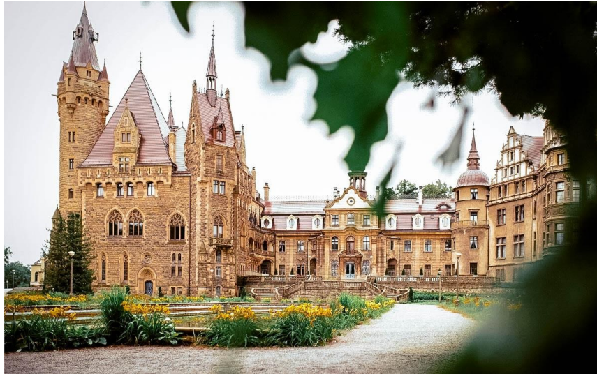
Mozna Castle – Poland. Owned consecutively by the German nobility and aristocrat families of Tiele-Winckler; von Reisewitz; von Seherr-Thoss (sherr thoss means “noble family”).

There are many hundreds of the Black Nobility residences scattered throughout all of Europe of the likes pictured above in this addendum commentary. The only Jewish banker family that nears the residents’ magnitude of the European aristocracy is the House of Rothschild that owns a few similar on the lower end of this scale. However, we need to include one more due to its importance throughout history as well as current events. It is that of the Pope’s residence in the Vatican City (Pictured below)