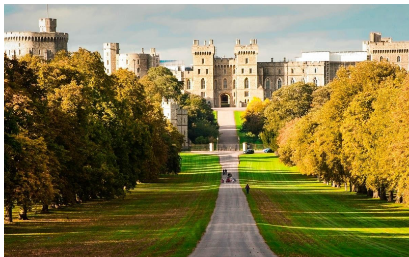
The Windsor Castle estate complex, England. Residence of the British monarch.