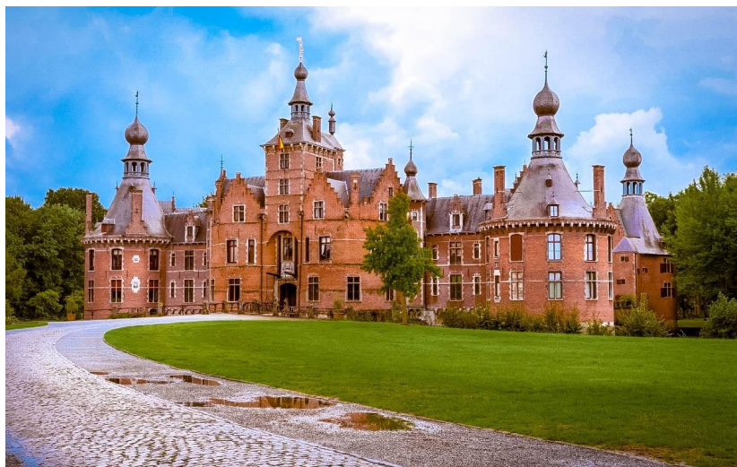
Ooidonk Castle in Belgium built in 1595, currently the home of Count t’Kint de Roodenbeke.

Space does not provide for more pictures and detailed related genealogies of all the European Royal families. The several above will suffice to illustrate the interwoven monarch control of the European continent. What we may additionally wish to note is the landed property possessions and residences of the ruling elite of European dynasties. What Americans view as ultimate homes of our “rich and famous” millionaires pale in comparison to the aristocracy of Europe. It should be mentioned that many once royal families of Europe decided to abdicate their royal notoriety and live a seldom seen existence of secluded aristocracy. These secluded have dropped the royal titles. The royalty and the aristocracy maintain property land holdings (as shown below) that number in the literally many hundreds of dwellings never realized by most people.