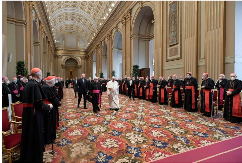
Above: Just one of the many hallways in the Apostolic Palace, meeting place of the modern religion of Nachash and its consortium of Baal Priests.

Black Nobility aristocrat extravaganzas and meetings have not changed over the centuries