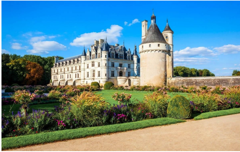
France – Chateau de Chenonceau

Residence of aristocracy notable Diane de Poitiers (1499 - 1566) located on the Cher River, near the city of Tours. She was the mistress of King Henry II and wielded much political influence as his advisor. The chateau is today owned by the prominent Menier family whose wealth began as pharmaceutical manufacturers in Paris in 1816 and expanded to London and New York. Menier is also famous for French chocolates.