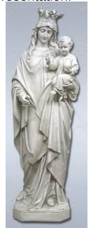
Nachash holding her family seed line of enmity, Gen. 3:15. She is not Mary as falsely claimed. She is Rome’s Queen of Heaven. (Jer 44; Rev 18:7)

The Black Nobility are the family of Cain that ruled the merchant power of Venice for 1000 years, then moved into Europe to usurp the royal houses. Today they operate from Rome, London, Washington D.C. “Black” refers to their wicked deeds not their skin color. This Cain family is not to be mistaken with “Jews” who are from Esau/Edom.(Communists) The Sirius Cult was known as Astarte worshipers in Bible times. Astarte was known as the goddess Ashtoreth by the Israelites (I Ki. 11:5,23) Below is her picture in modern “world church” representation: