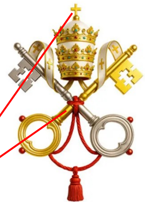
The Vatican's coat of arms

Not only did the theme of paganism over and above Jacob's descendants find its way into the Babylonian and Assyrian cultures as well as into the Union Jack of the BEIC, another group that runs in the same circles with Saxon Israel's enemies is the Roman Catholic Church. This institution works closely with the top echelon of Mystery Babylon's* world system to undermine Christian liberty. The Vatican's coat of arms shows the same motif of the pagan cross over a deliberate X design in the same style used by kings who were Israel's adversaries.