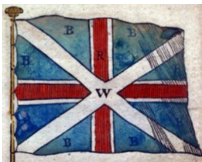
Proposed Scottish Union Flag as depicted in the 1704 edition of The Present Sate of the Universe

It should also be noted that loyalists in Scotland wanted no union with England and told both the Scottish and English governments that the only new flag they would settle for would be Scotland's flag with Andrew's X overtop of the English Venetian Guelph cross. The flag proposed by the Scottish loyalists is seen below (left). The flag, of course, was dismissed by the Black Nobility's political power and influence it held by now in both nations, but the point was made by brave Scots who were aware of what was being done. (The movie Brave Heart was basically accurate concerning the Scot's feelings toward England)