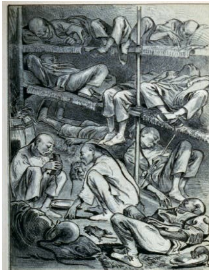
1850 lithograph of an opium den in China

While this was going on the situation in China was even worse. During the mid to late 1800's the addiction to opium in China became increasingly monumental. Britain was getting her tea but the Chinese were becoming a nation of hapless drug addicts. Opium dens had become the norm with many people's lives wasted away by remaining long hours, days, and weeks in these confines of opium smoking hiding places.