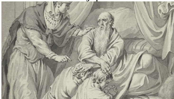
Portrait -- Jacob blessing Ephraim and Manasseh

Contrary to Jacob/Israel’s heraldry sign of the crossed arms x, we find the antithesis in the pagan cross of the + (T) of the many ancient ungodly nations with whom Yahweh God had no family relationship (Ps. 147:19-20). That type of cross sign has been shown, through recorded history and relics of pagans, as being the recognized mark of the Sumerian and Babylonian god Tammuz who was the consort of the occult goddess Ishtar. We won’t elaborate here for lack of space since this subject was covered in the short studies suggested on page 2 (see). The sign of the Latin Cross used for crucifixes