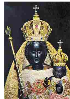
Black Madonna Swiss

--- plus many others historically world wide not depicted here.